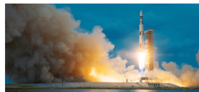
Mobile & Aerospace