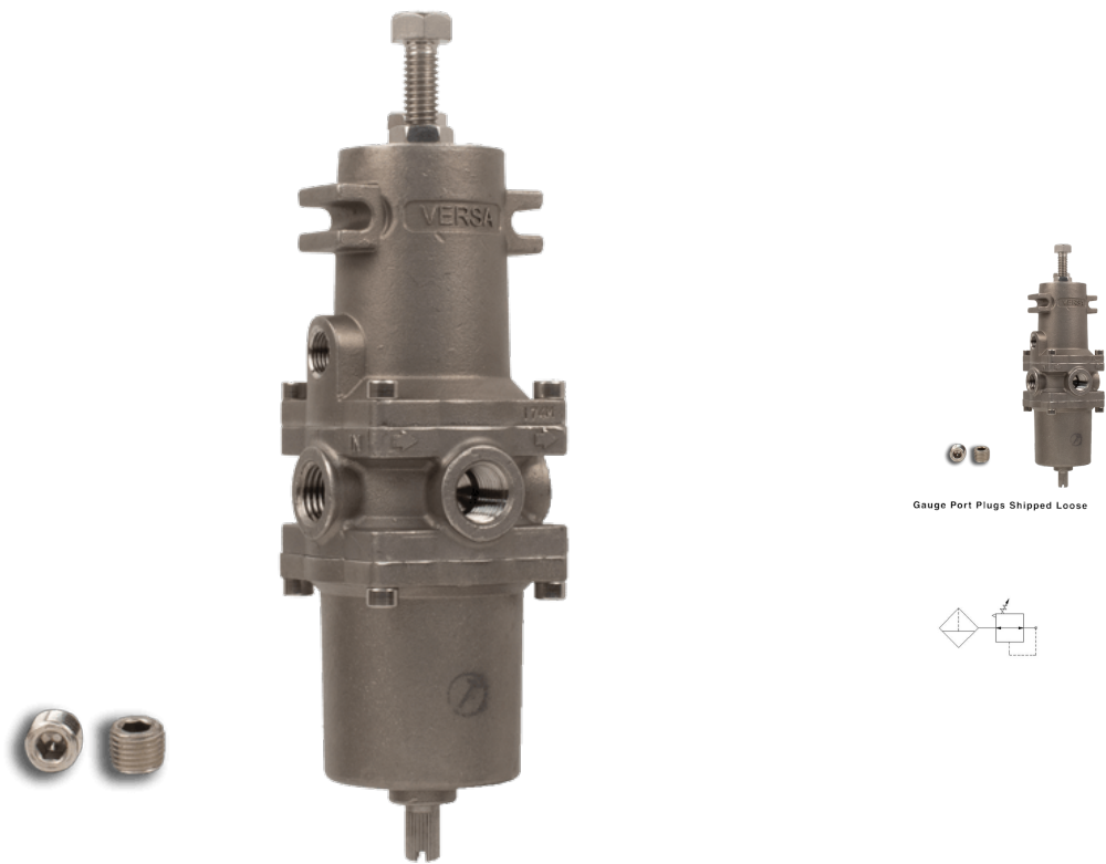
Gauge Port Plugs Shipped Loose