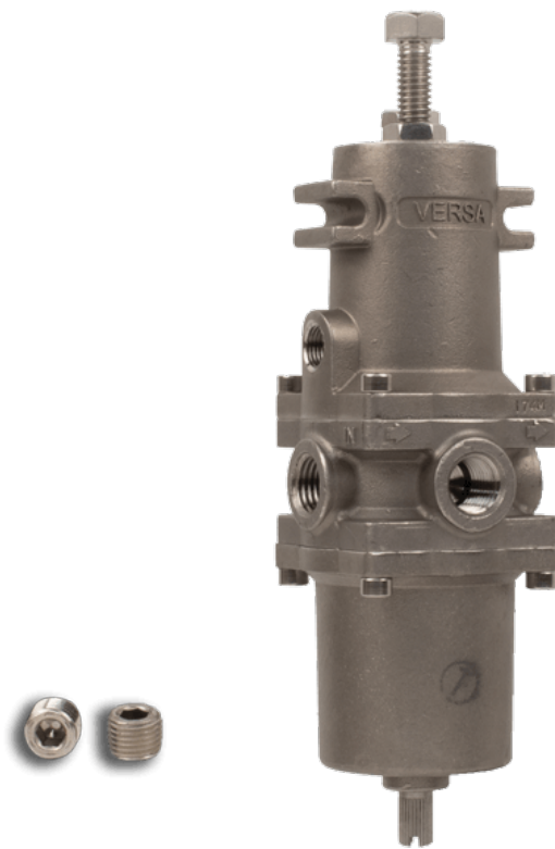
Gauge Port Plugs Shipped Loose