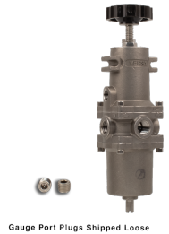
Gauge Port Plugs Shipped Loose