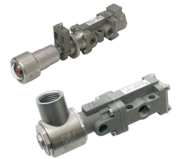
Image for reference only. May not reflect actual product configuration.