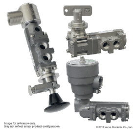
Image for reference only. May not reflect actual product configuration.