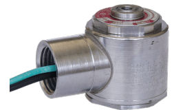
Image for reference only. May not reflect actual product configuration.