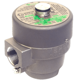
© 2018 Versa Products Co., Inc.