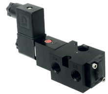
Image for reference only. May not reflect actual product configuration.