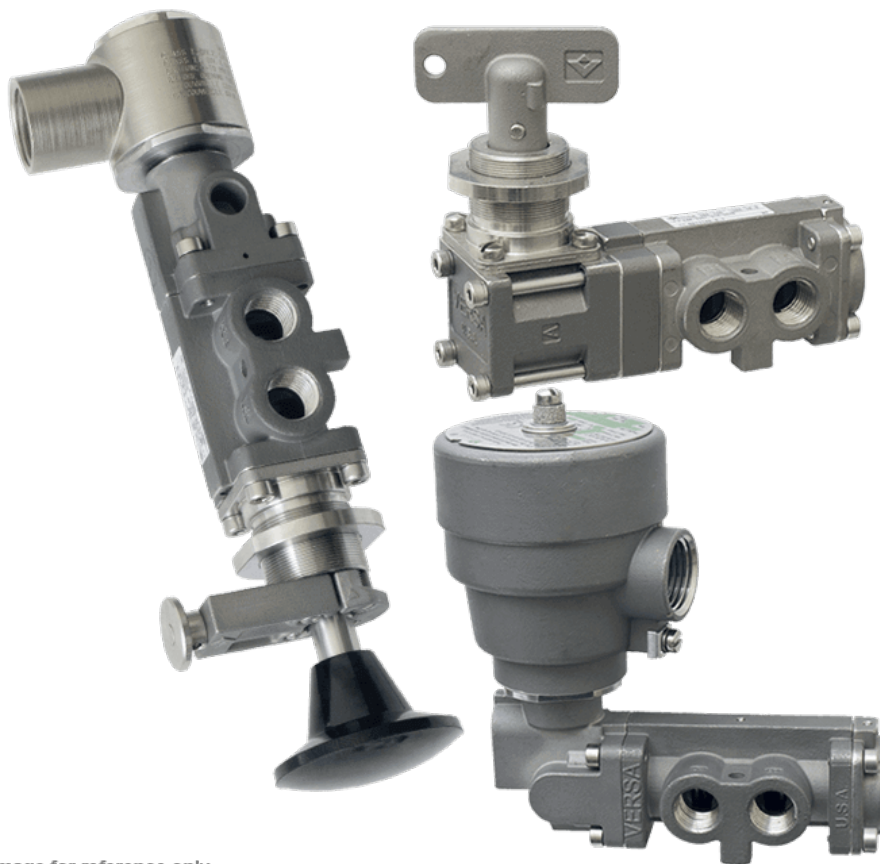
Image for reference only. May not reflect actual product configuration.