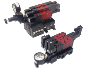
Image for reference only. May not reflect actual product configuration.