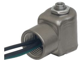
Image for reference only. May not reflect actual product configuration.