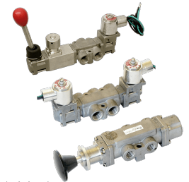
Image for reference only. May not reflect actual product configuration.

Image for reference only. May not reflect actual product configuration.