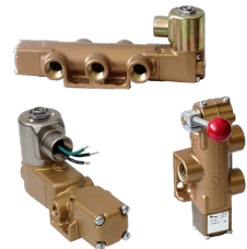
Image for reference only. May not reflect actual product configuration.