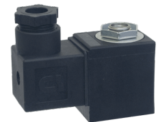
Image for reference only. May not reflect actual product configuration.