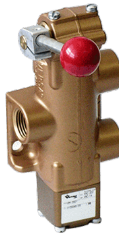
Image for reference only. May not reflect actual product configuration.