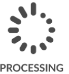
Image for reference only. May not reflect actual product configuration.