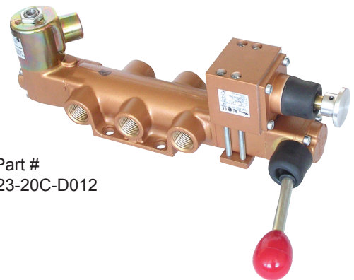
Part # VGK-4523-20C-D012